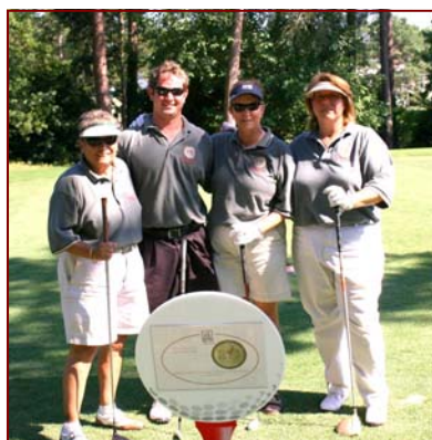
Hole Sponsor EPI

Everyone had fun purchasing mulligans and putting them to good use as evidenced by the impressive scores of the day. The 50/50 raffle tickets were a big success, netting both Summit House and the winner $127.50!