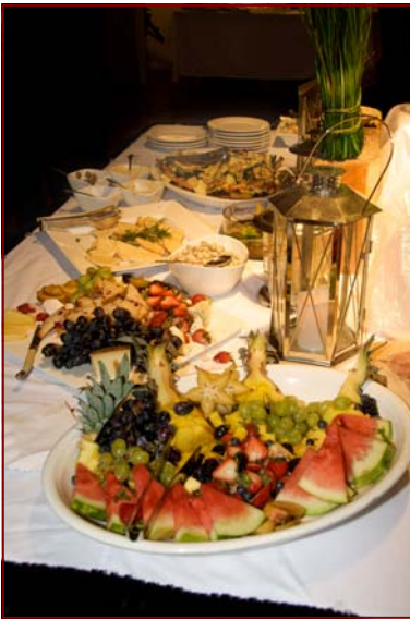
Buffet Selections by XU Catering

The silent auction was a flurry of activity as folks clamored to win treasures from over $18,000 worth of donated items. Our local (and national) community donated items ranging from a cruise, spa treatments, and local restaurant certificates to fine jewelry, art and golf!