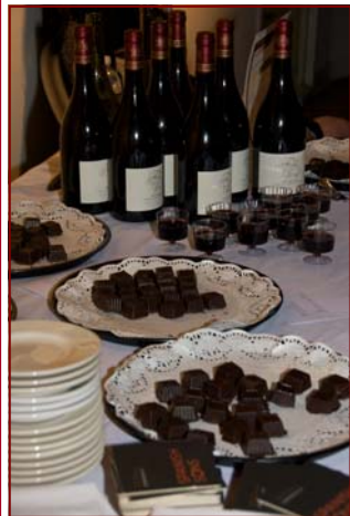
Azurelise Chocolate Truffles paired with La Font du Vent Cote du Rhone Village Passion from France